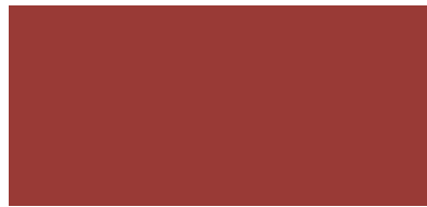
P276 Safety Red-Pool*

NOTE: Colors represented are digital reproductions of actual standards and will vary in appearance due to differences in monitor and video card output. These digital representations should not be used to finalize color selection(s). Please contact your Tnemec representative for color-accurate samples or for assistance with suitable primer and finish coat selections and color matching.