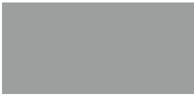
P007 Light Gray-Pool*