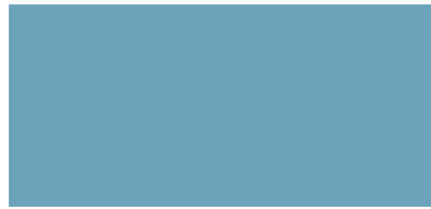
P006 Delft Blue-Pool