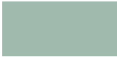
P009 Mineral Water-Pool*