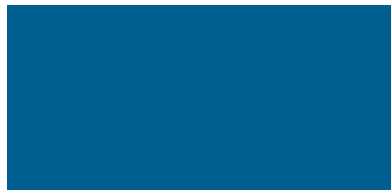
P021 True Blue/Safety-Pool*