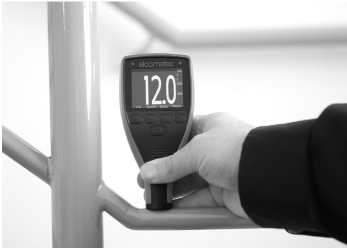
Above: Elcometer Type II Dry Film Thickness Gauge