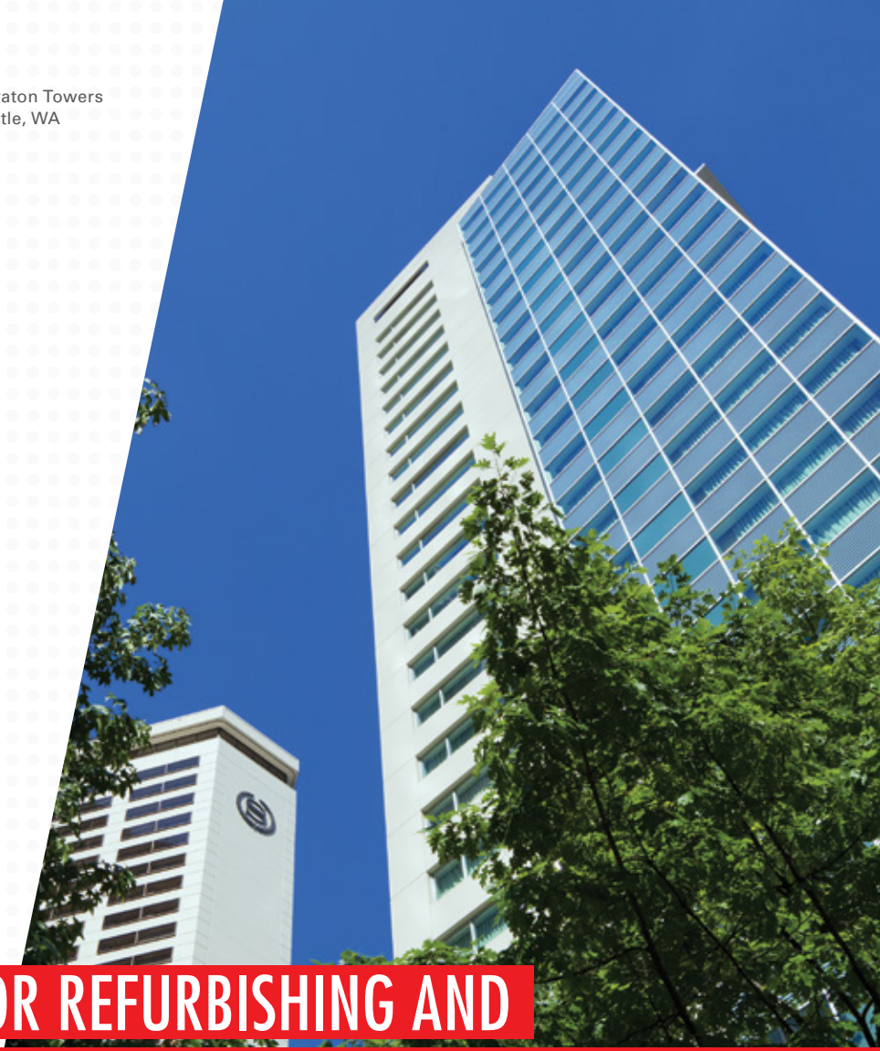
right: Sheraton Towers Seattle, WA