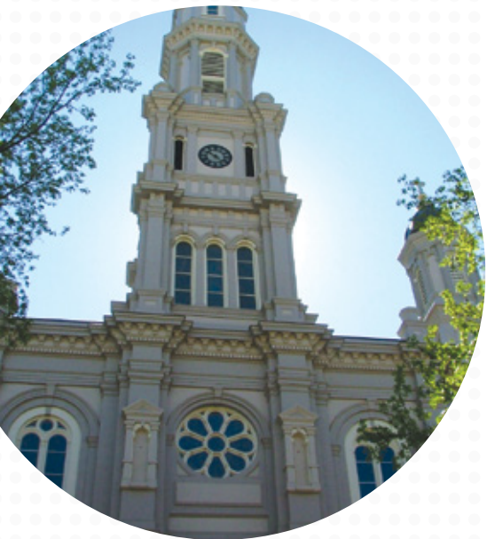
below: Cathedral of the Blessed Sacrament Sacramento, CA

Careful surface preparation allowed for the application of Enviro-Crete, a smooth, breathable waterborne acrylate coating to blend into the exterior and protect against driving rain, sleet, freeze and thaw. An additional coat was then roller-applied as a topcoat, which was used to fill and hide weather-induced surface imperfections. As a result, Assembly Hall was restored to its iconic glory.