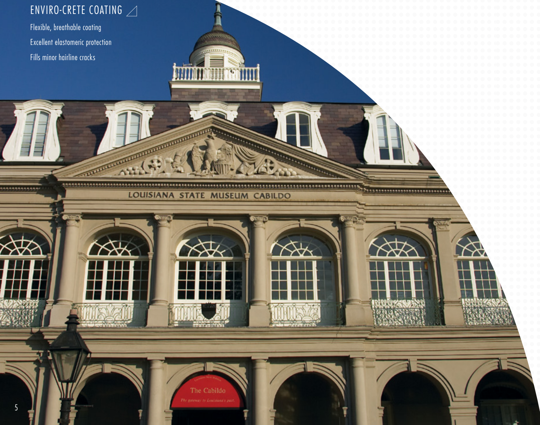
left: The Cabildo New Orleans, LA